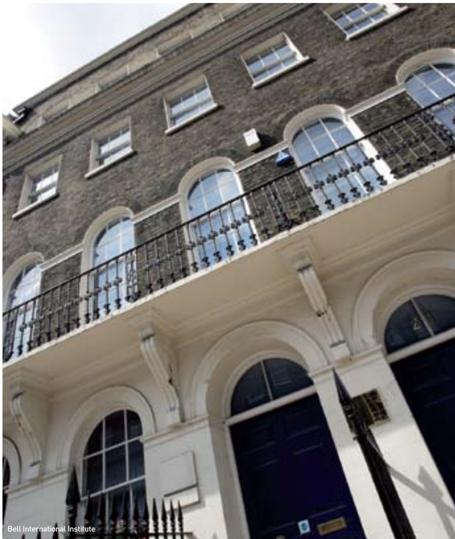
Bell International Institute